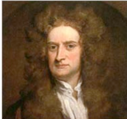
Agence France-Presse/Getty Images, top; Granger Collection

CALCULATIONS Newton feuded with Leibniz over the discovery of calculus, but Grigory Perelman, top, claimed to put himself above such banalities.