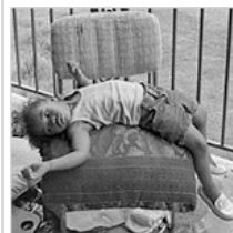
Interactive Feature: Children of the Storm