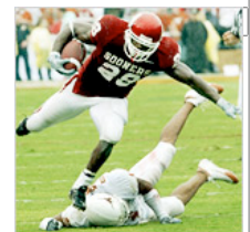
College Football Preview