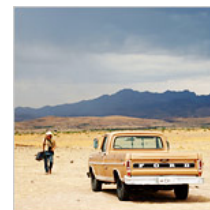
Hollywood Stampedes a Texas Town