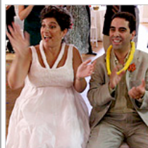
Weddings & Celebrations