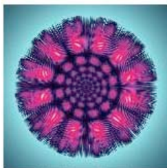
A periodic segment of the song of the Minke Whale Balenoptera acutorostrata ; graphic generated using wavelet analysis; plotted in polar coordinates with time = \theta.