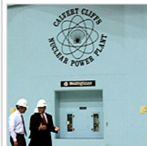
Slow Start for Revival of Nuclear Reactors