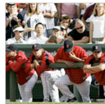
Vecsey: Stunned by a Sweep