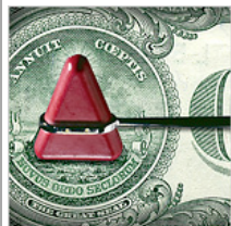
Making Health Care Drive the Economy