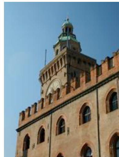
The University of Bologna.